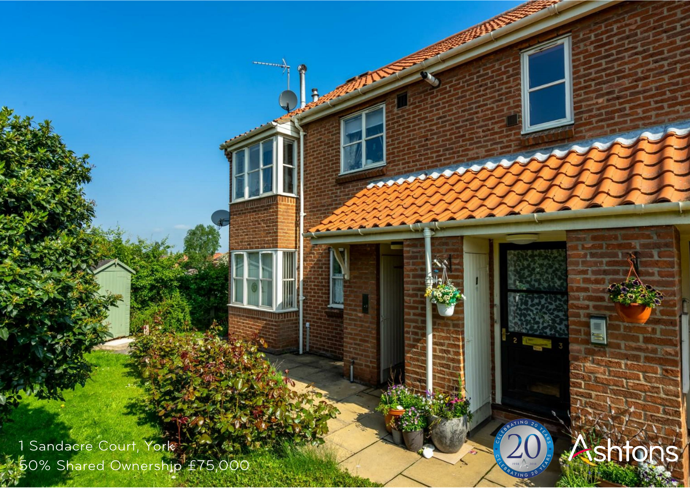
1 Sandacre Court, York 50% Shared Ownership £75,000